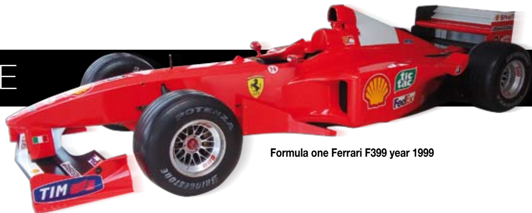
Formula one Ferrari F399 year 1999